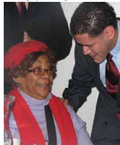
Senior Valentine’s Day dance.