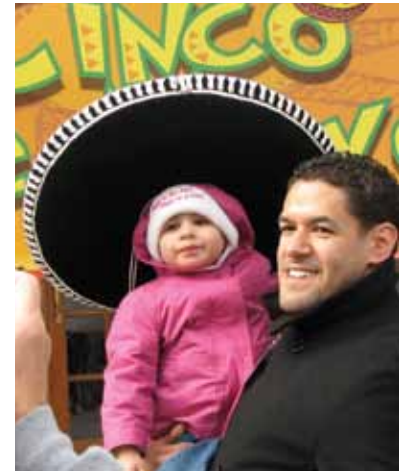
Cinco de Mayo Celebration.