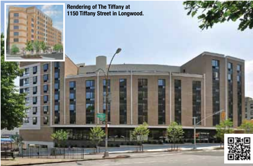
Rendering of The Tiffany at 1150 Tiffany Street in Longwood.