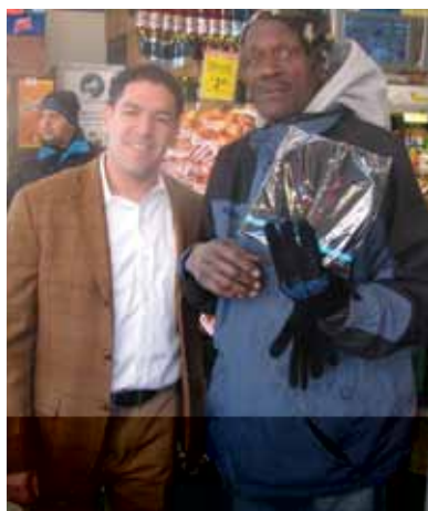
Coat drive at C-Town Supermarket.